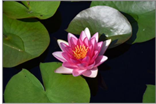
Attraction Hardy Water Lily flowers