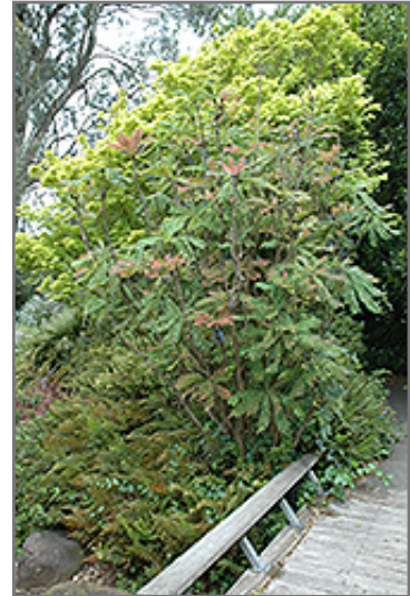
Chinese Mahonia

This shrub does best in partial shade to full shade. Keep it well away from hot, dry locations that receive direct afternoon sun or which get reflected sunlight, such as against the south side of a white wall. It does best in average to evenly moist conditions, but will not tolerate standing water. It may require supplemental watering during periods of drought or extended heat. It is not particular as to soil pH, but grows best in rich soils. It is somewhat tolerant of urban pollution, and will benefit from being planted in a relatively sheltered location. Consider applying a thick mulch around the root zone in winter to protect it in exposed locations or colder microclimates. This species is not originally from North America.