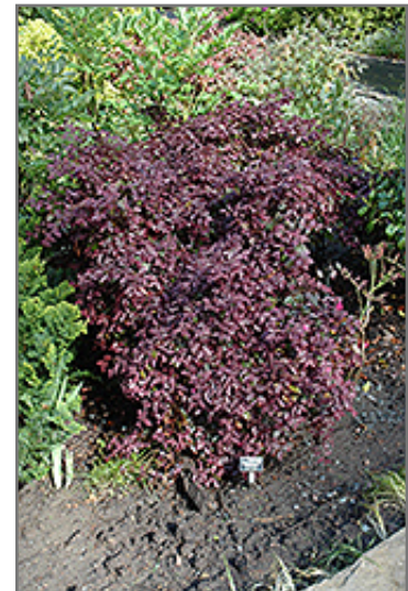
Burgundy Fringeflower