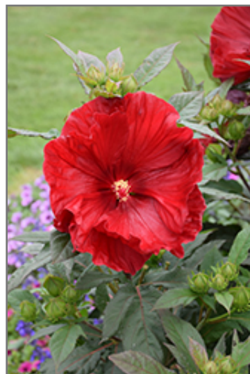
Summerific Cranberry Crush Hibiscus flowers