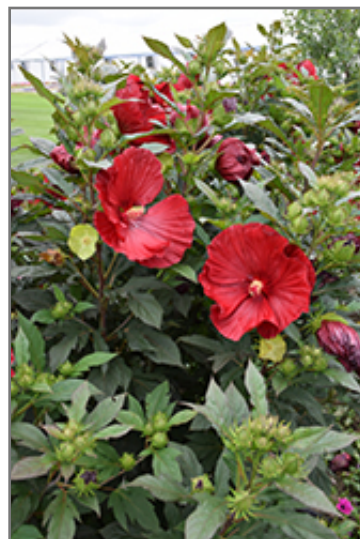
Summerific Cranberry Crush Hibiscus flowers