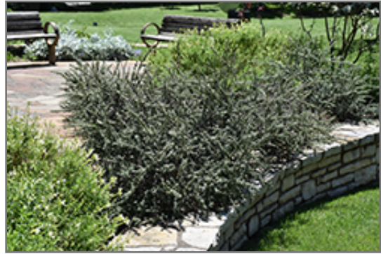
Gray Leaf Cotoneaster