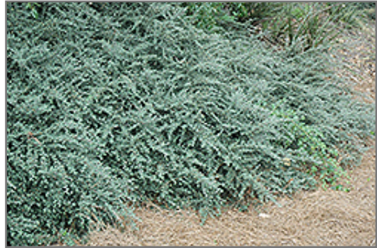
Gray Leaf Cotoneaster

Gray Leaf Cotoneaster will grow to be about 4 feet tall at maturity, with a spread of 6 feet. It tends to fill out right to the ground and therefore doesn't necessarily require facer plants in front. It grows at a fast rate, and under ideal conditions can be expected to live for approximately 30 years.