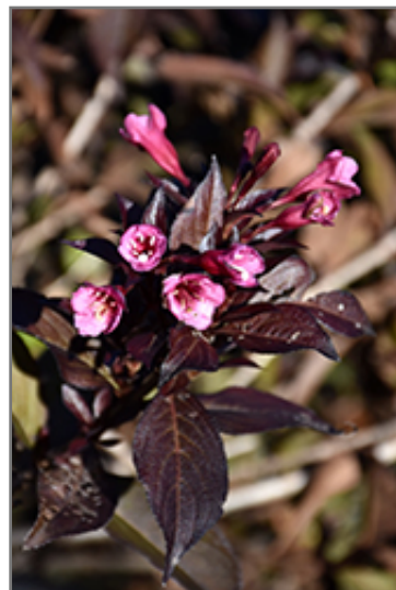
Fine Wine Weigela flowers