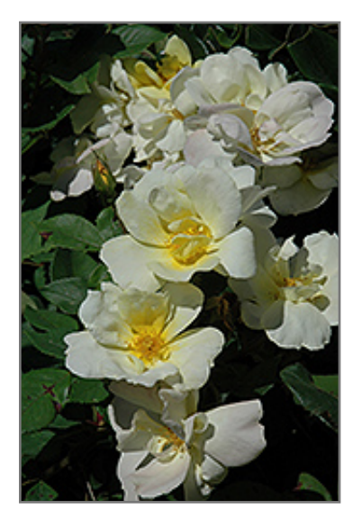
Sunny Knock Out Rose flowers