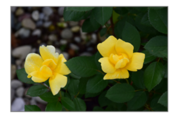
Sunny Knock Out Rose flowers