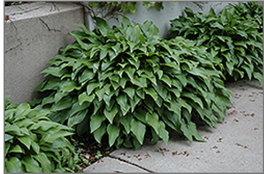
Invincible Hosta

Invincible Hosta is recommended for the following landscape applications;