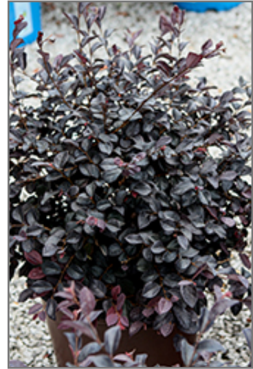
Cherry Blast Fringeflower

Cherry Blast Fringeflower makes a fine choice for the outdoor landscape, but it is also well-suited for use in outdoor pots and containers. Because of its height, it is often used as a 'thriller' in the 'spiller-thriller-filler' container combination; plant it near the center of the pot, surrounded by smaller plants and those that spill over the edges. It is even sizeable enough that it can be grown alone in a suitable container. Note that when grown in a container, it may not perform exactly as indicated on the tag - this is to be expected. Also note that when growing plants in outdoor containers and baskets, they may require more frequent waterings than they would in the yard or garden.