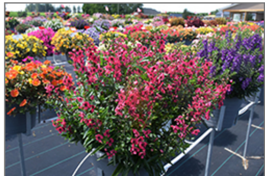
Archangel Cherry Red Angelonia in bloom