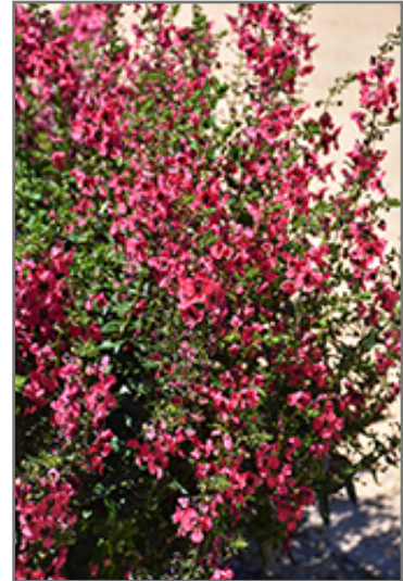
Archangel Cherry Red Angelonia flowers

Archangel Cherry Red Angelonia is an herbaceous annual with an upright spreading habit of growth. Its relatively fine texture sets it apart from other garden plants with less refined foliage.