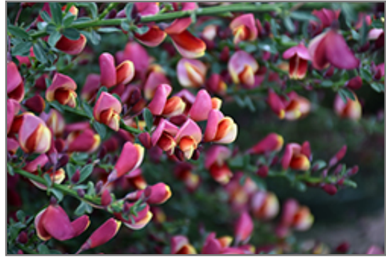
Burkwood's Broom flowers