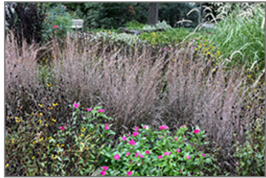
Standing Ovation Bluestem in fall

Standing Ovation Bluestem is recommended for the following landscape applications;