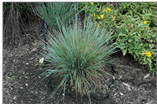
Standing Ovation Bluestem