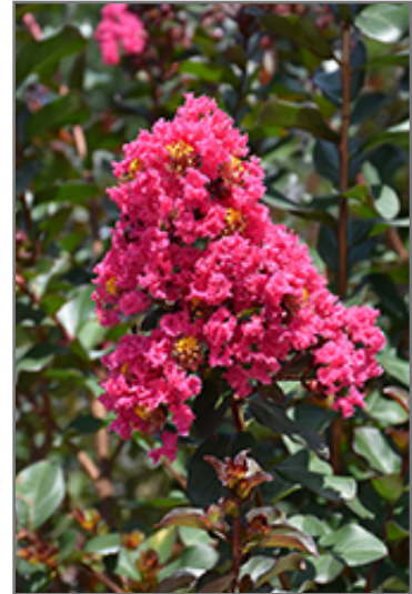
Pink Velour Crapemyrtle flowers