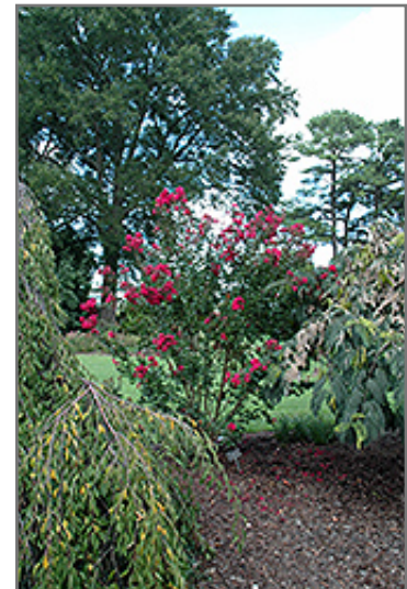
Pink Velour Crapemyrtle in bloom