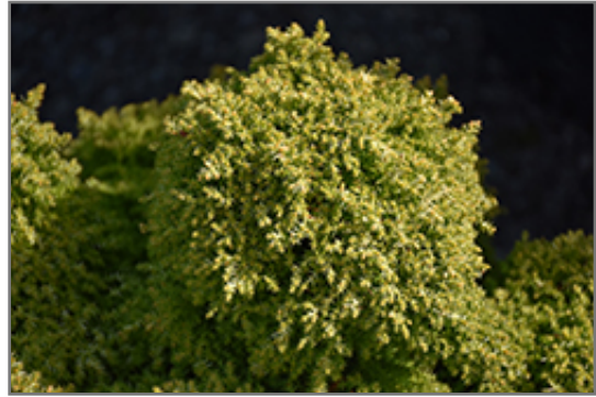
Twinkle Toes Japanese Cedar foliage