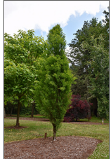
Lindsey's Skyward Bald Cypress