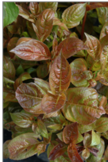
Wings Of Fire Weigela foliage

This shrub should only be grown in full sunlight. It prefers to grow in average to moist conditions, and shouldn't be allowed to dry out. It may require supplemental watering during periods of drought or extended heat. It is not particular as to soil type or pH. It is highly tolerant of urban pollution and will even thrive in inner city environments. This is a selected variety of a species not originally from North America.