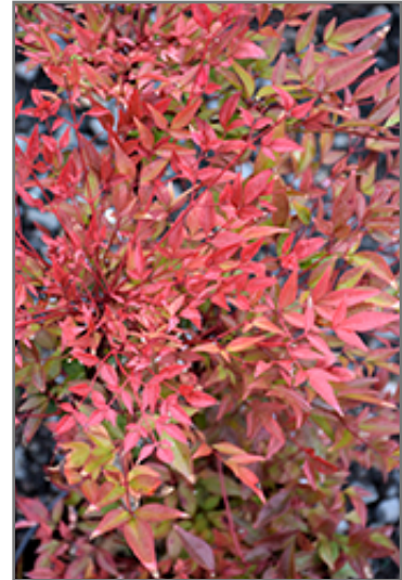
Obsession Nandina foliage