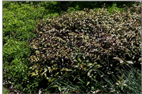
Scarletta Fetterbush