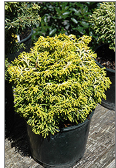
Butterball Hinoki Falsecypress