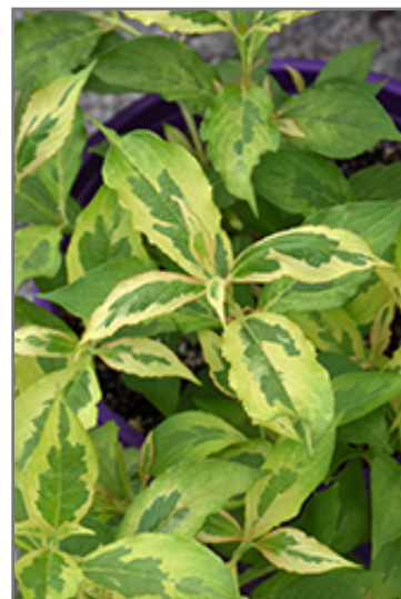
My Monet Sunset Weigela foliage

My Monet Sunset Weigela is recommended for the following landscape applications;