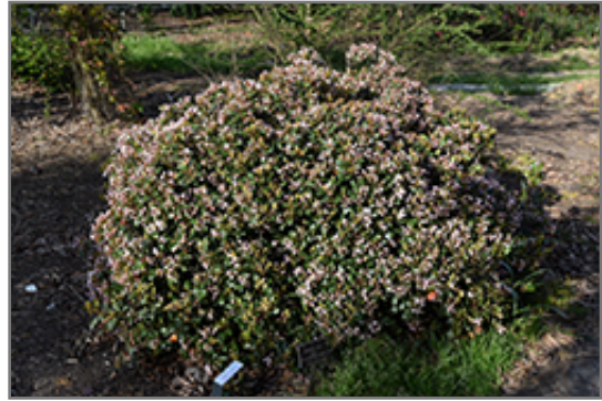
Eleanor Taber Indian Hawthorn in bloom

Eleanor Taber Indian Hawthorn is recommended for the following landscape applications;