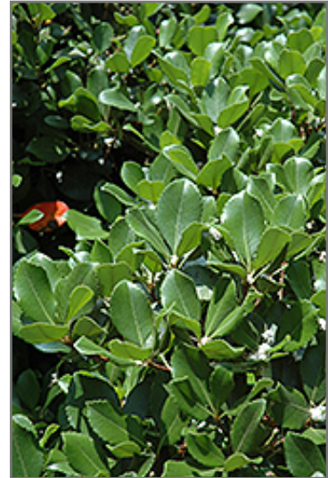
Eleanor Taber Indian Hawthorn foliage

This shrub does best in full sun to partial shade. It prefers to grow in average to moist conditions, and shouldn't be allowed to dry out. It may require supplemental watering during periods of drought or extended heat. It is not particular as to soil type or pH. It is somewhat tolerant of urban pollution. This is a selected variety of a species not originally from North America.