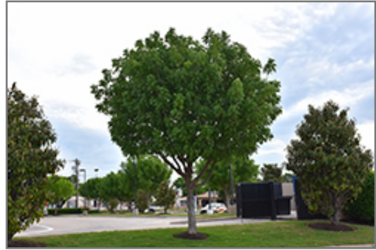
Chinese Pistache