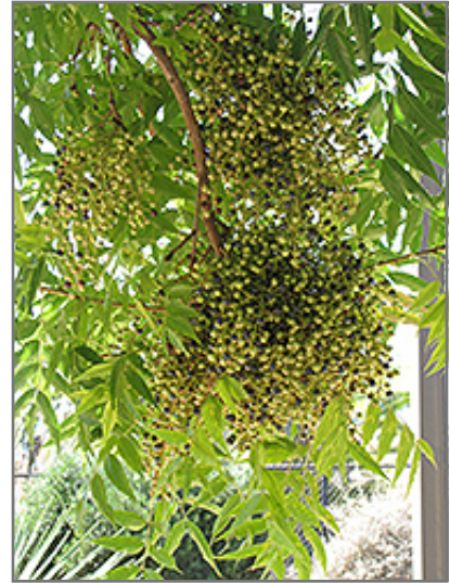
Chinese Pistache fruit

This tree should only be grown in full sunlight. It is very adaptable to both dry and moist growing conditions, but will not tolerate any standing water. It may require supplemental watering during periods of drought or extended heat. It is not particular as to soil type or pH. It is highly tolerant of urban pollution and will even thrive in inner city environments. This species is not originally from North America.