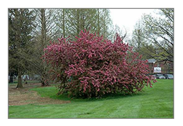
Indian Summer Flowering Crab in bloom

This tree will require occasional maintenance and upkeep, and is best pruned in late winter once the threat of extreme cold has passed. It has no significant negative characteristics.