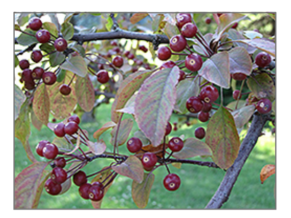
Indian Summer Flowering Crab foliage

This tree should only be grown in full sunlight. It prefers to grow in average to moist conditions, and shouldn't be allowed to dry out. It may require supplemental watering during periods of drought or extended heat. It is not particular as to soil type or pH. It is highly tolerant of urban pollution and will even thrive in inner city environments. This particular variety is an interspecific hybrid.