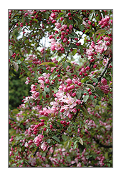
Indian Summer Flowering Crab flowers