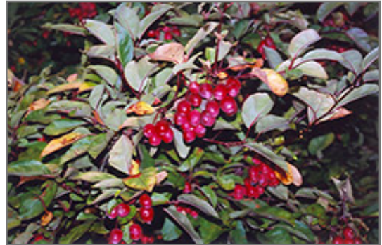
Adams Flowering Crab fruit

This tree should only be grown in full sunlight. It prefers to grow in average to moist conditions, and shouldn't be allowed to dry out. It may require supplemental watering during periods of drought or extended heat. It is not particular as to soil type or pH. It is highly tolerant of urban pollution and will even thrive in inner city environments. This particular variety is an interspecific hybrid.