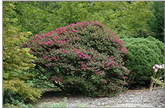
Pocomoke Crapemyrtle in bloom