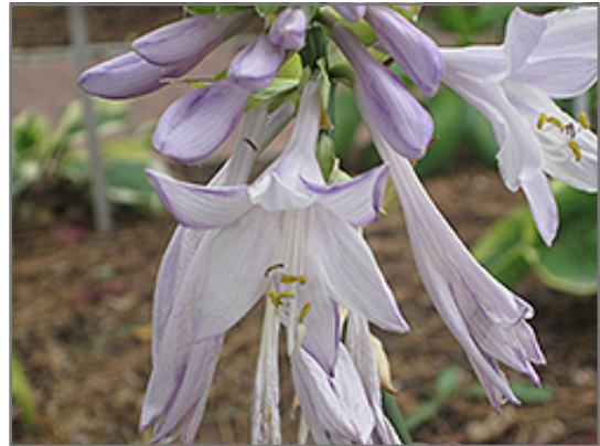
Fried Bananas Hosta flowers

Fried Bananas Hosta will grow to be about 24 inches tall at maturity extending to 3 feet tall with the flowers, with a spread of 4 feet. When grown in masses or used as a bedding plant, individual plants should be spaced approximately 4 feet apart. Its foliage tends to remain dense right to the ground, not requiring facer plants in front. It grows at a fast rate, and under ideal conditions can be expected to live for approximately 10 years. As an herbaceous perennial, this plant will usually die back to the crown each winter, and will regrow from the base each spring. Be careful not to disturb the crown in late winter when it may not be readily seen!