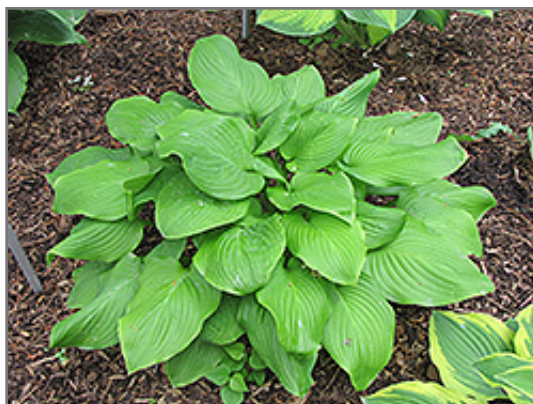
Fried Bananas Hosta