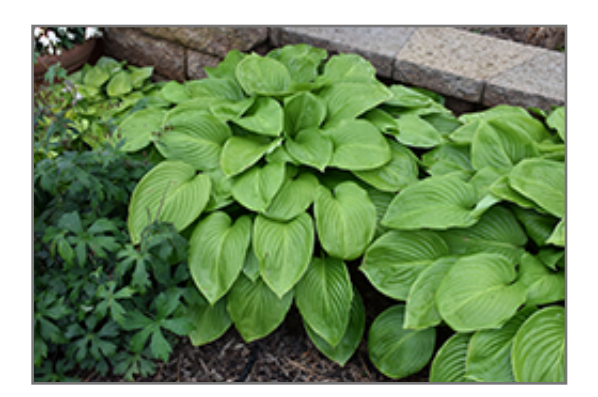
Aphrodite Hosta

This is a relatively low maintenance plant, and is best cleaned up in early spring before it resumes active growth for the season. Gardeners should be aware of the following characteristic(s) that may warrant special consideration;