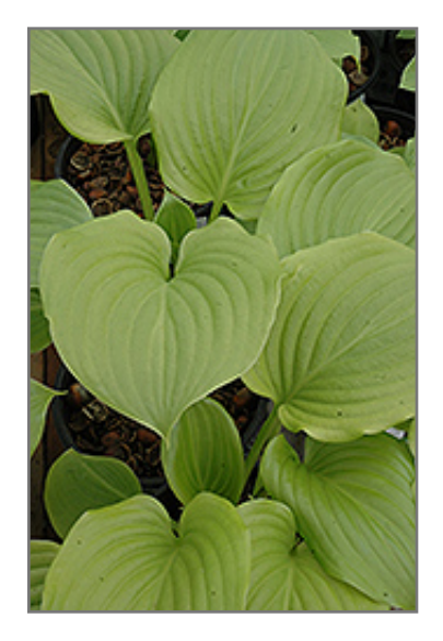
Aphrodite Hosta foliage