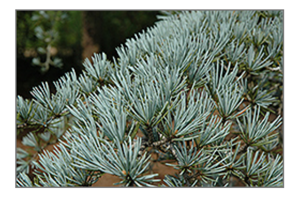
Sander's Blue Deodar Cedar foliage