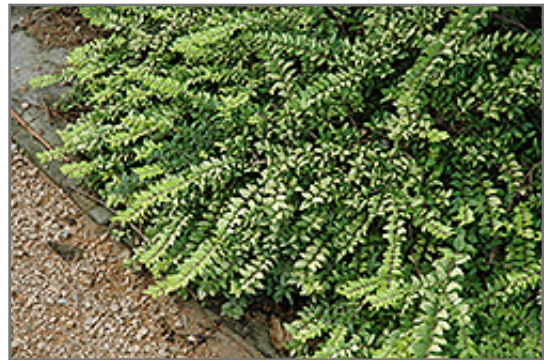
Edmee Gold Honeysuckle