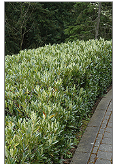
Otto Luyken Dwarf Cherry Laurel in bloom