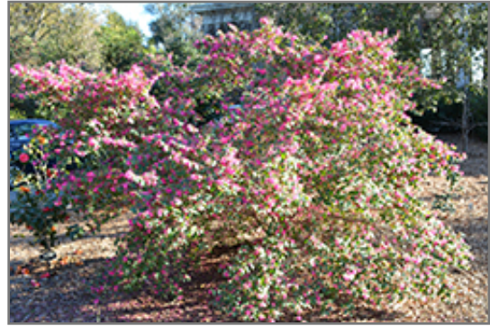
Razzleberri Fringeflower in bloom

This shrub does best in full sun to partial shade. It prefers to grow in average to moist conditions, and shouldn't be allowed to dry out. It may require supplemental watering during periods of drought or extended heat. It is particular about its soil conditions, with a strong preference for rich, acidic soils. It is somewhat tolerant of urban pollution. Consider applying a thick mulch around the root zone in winter to protect it in exposed locations or colder microclimates. This is a selected variety of a species not originally from North America.