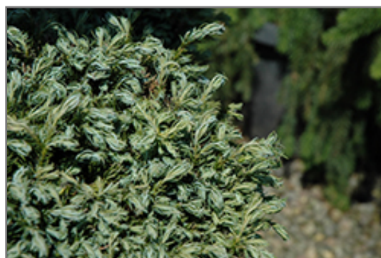
Cyano-Viridis Poodle Form Falsecypress foliage