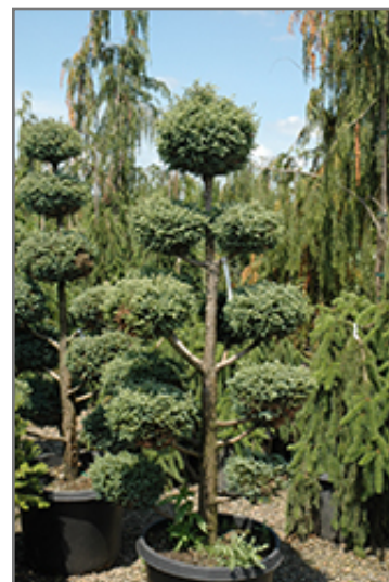
Cyano-Viridis Poodle Form Falsecypress

This is a relatively low maintenance shrub. When pruning is necessary, it is recommended to only trim back the new growth of the current season, other than to remove any dieback. It has no significant negative characteristics.