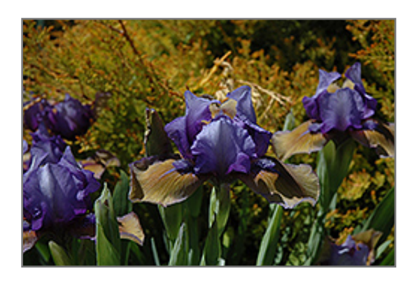
Blueberry Tart Iris flowers