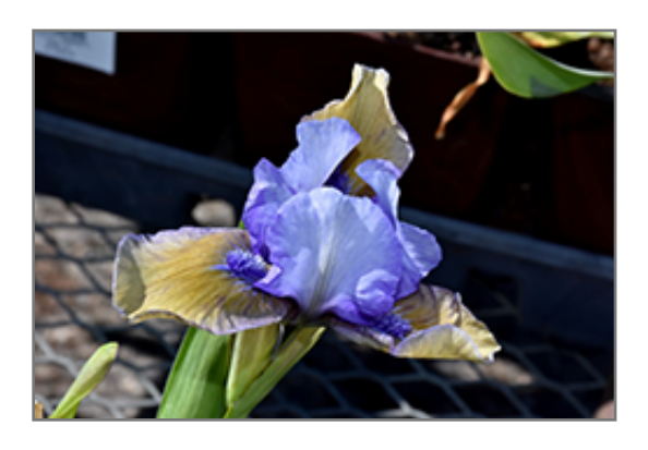
Blueberry Tart Iris flowers