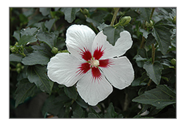
Lil' Kim Rose of Sharon flowers

Lil' Kim Rose of Sharon is recommended for the following landscape applications;