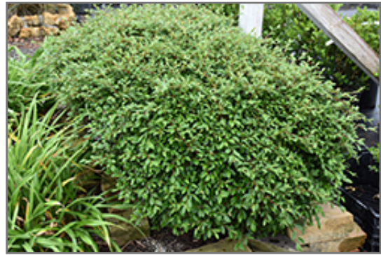
Scarlet Leader Willowleaf Cotoneaster

This shrub will require occasional maintenance and upkeep, and should not require much pruning, except when necessary, such as to remove dieback. It is a good choice for attracting birds to your yard, but is not particularly attractive to deer who tend to leave it alone in favor of tastier treats. Gardeners should be aware of the following characteristic(s) that may warrant special consideration;