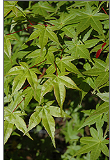
Shindeshojo Japanese Maple foliage

Shindeshojo Japanese Maple is recommended for the following landscape applications;