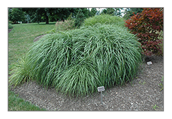
Adagio Maiden Grass foliage