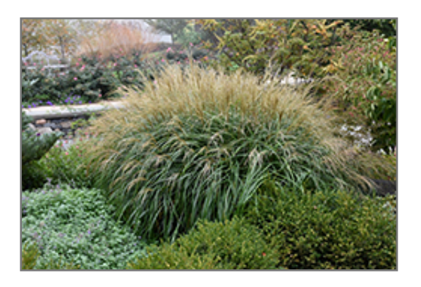
Adagio Maiden Grass flowers