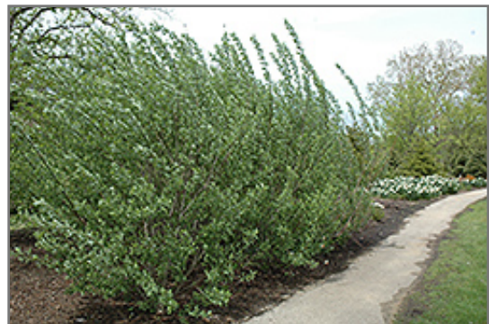
French Pussy Willow