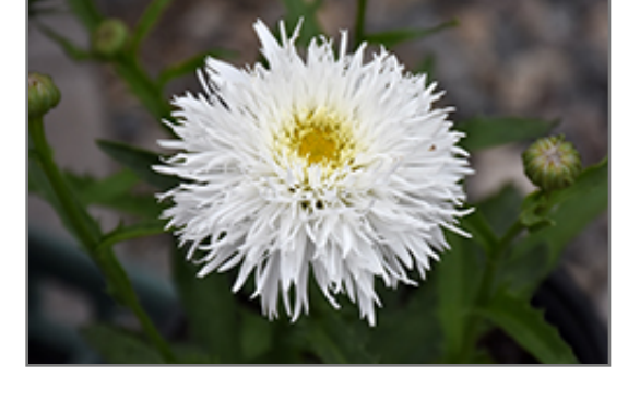
Sante Shasta Daisy flowers