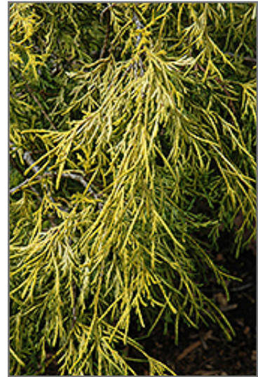
Lemon Thread Falsecypress foliage