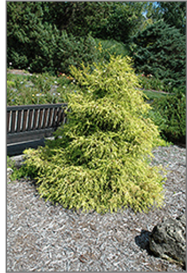
Lemon Thread Falsecypress

Lemon Thread Falsecypress is recommended for the following landscape applications;