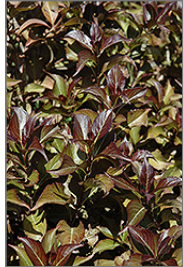
Dark Horse Weigela foliage

This shrub should only be grown in full sunlight. It prefers to grow in average to moist conditions, and shouldn't be allowed to dry out. It may require supplemental watering during periods of drought or extended heat. It is not particular as to soil type or pH. It is highly tolerant of urban pollution and will even thrive in inner city environments. This is a selected variety of a species not originally from North America.