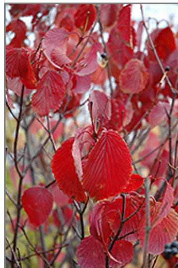
Arrowwood in fall