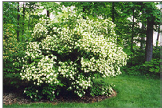
Arrowwood in bloom

This shrub does best in full sun to partial shade. It prefers to grow in average to moist conditions, and shouldn't be allowed to dry out. It may require supplemental watering during periods of drought or extended heat. It is not particular as to soil type or pH. It is highly tolerant of urban pollution and will even thrive in inner city environments. This species is native to parts of North America.