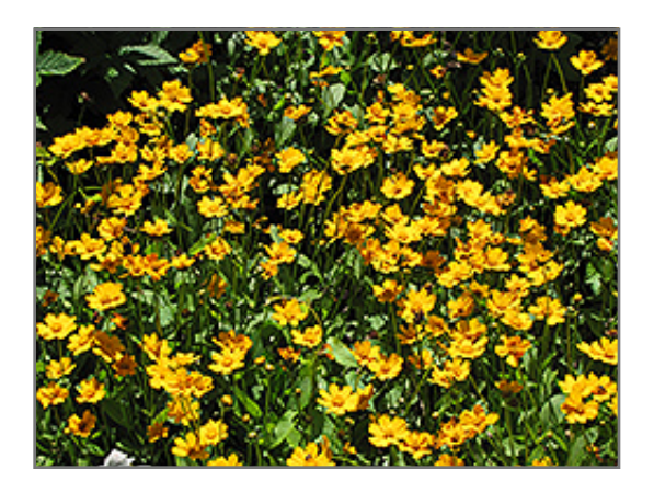
Dwarf Tickseed in bloom

Dwarf Tickseed is recommended for the following landscape applications;