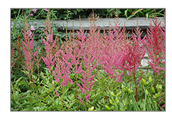
Visions in Pink Chinese Astilbe flowers