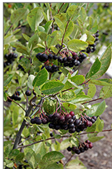
Iroquois Beauty Black Chokeberry fruit