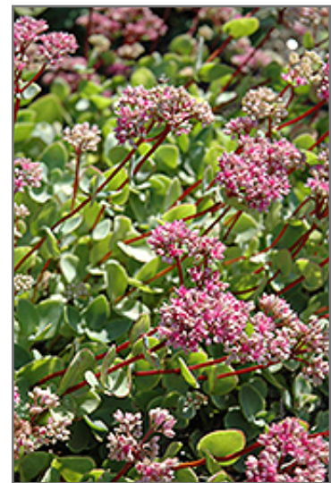
October Daphne flowers