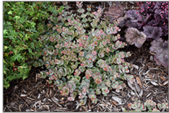
October Daphne