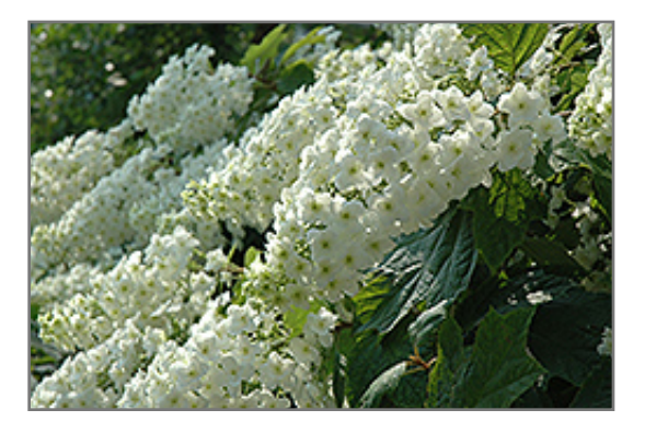
Snowflake Hydrangea flowers

Snowflake Hydrangea is recommended for the following landscape applications;