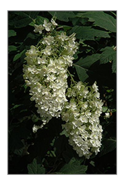
Snowflake Hydrangea flowers

This shrub performs well in both full sun and full shade. It prefers to grow in average to moist conditions, and shouldn't be allowed to dry out. It may require supplemental watering during periods of drought or extended heat. It is not particular as to soil type or pH. It is somewhat tolerant of urban pollution, and will benefit from being planted in a relatively sheltered location. Consider applying a thick mulch around the root zone in winter to protect it in exposed locations or colder microclimates. This is a selection of a native North American species.