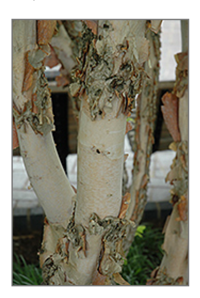
Fox Valley River Birch bark

Fox Valley River Birch is recommended for the following landscape applications;