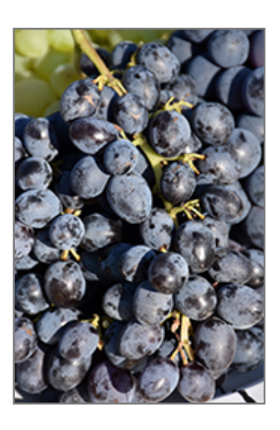
Jupiter Grape fruit