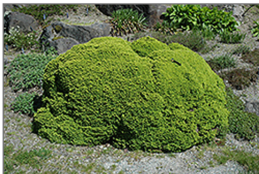
Little Gem Spruce