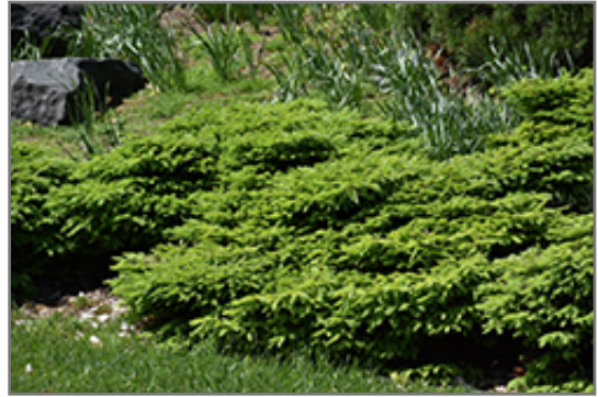
Little Gem Spruce

This shrub does best in full sun to partial shade. It does best in average to evenly moist conditions, but will not tolerate standing water. It may require supplemental watering during periods of drought or extended heat. It is not particular as to soil type or pH, and is able to handle environmental salt. It is highly tolerant of urban pollution and will even thrive in inner city environments. This is a selected variety of a species not originally from North America.